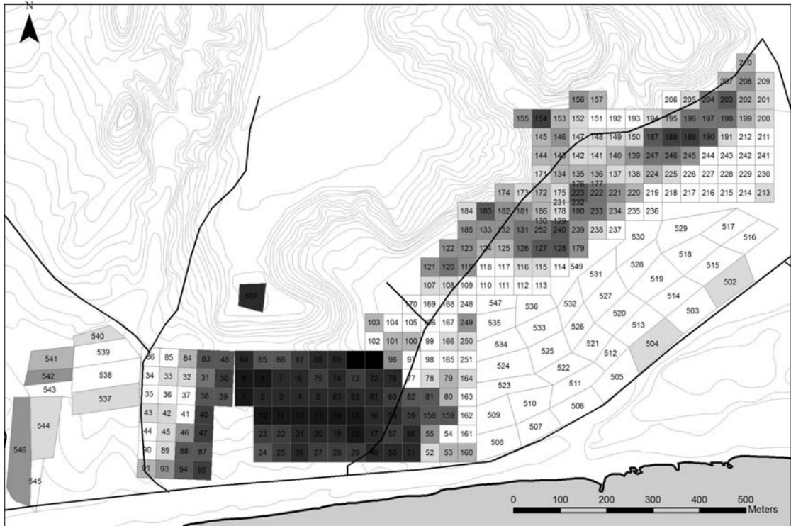
Map 1. The Distribution of Artifacts across the site of Pyla-Koutsopetria.